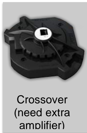
Crossover (need extra amplifier)